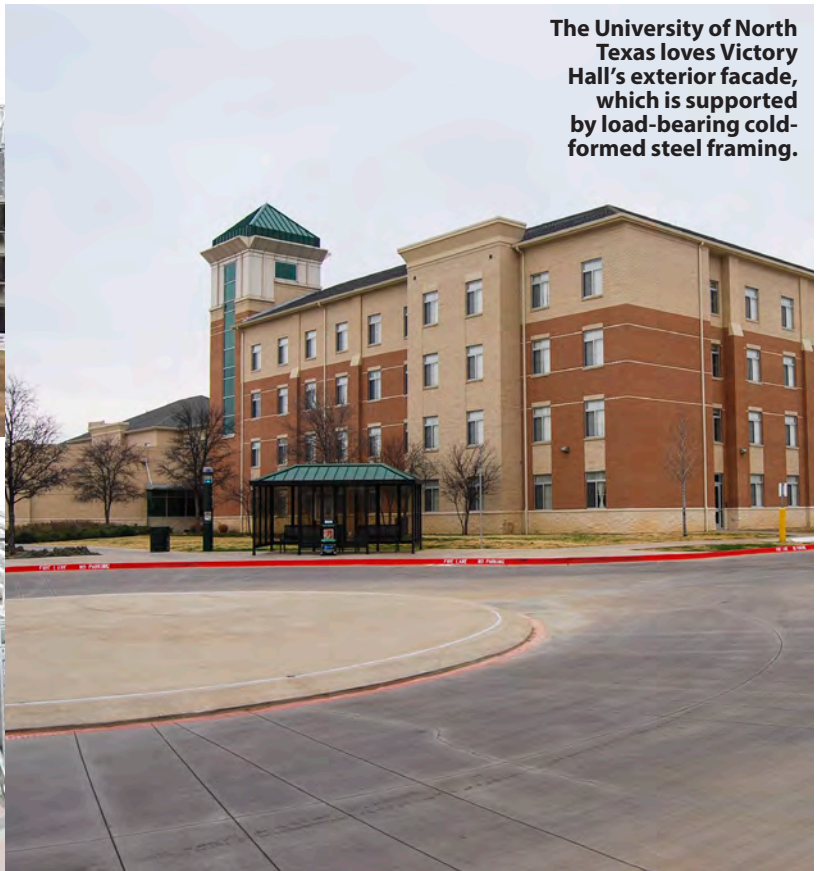
The University of North Texas loves Victory Hall's exterior facade, which is supported by load-bearing cold-formed steel framing.

formed steel after construction was underway. "I got to know all the architects and the design-build people at UNT," he says "One night at a social event, Victory Hall came up in conversation. I learned the university was having trouble with its scheduling and costs."