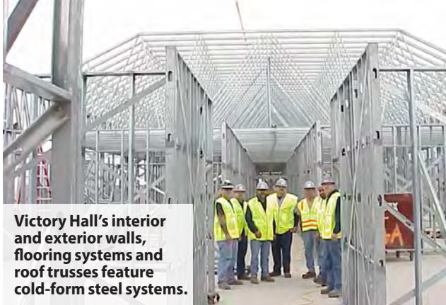
Victory Hall's interior and exterior walls, flooring systems and roof trusses feature cold-form steel systems.